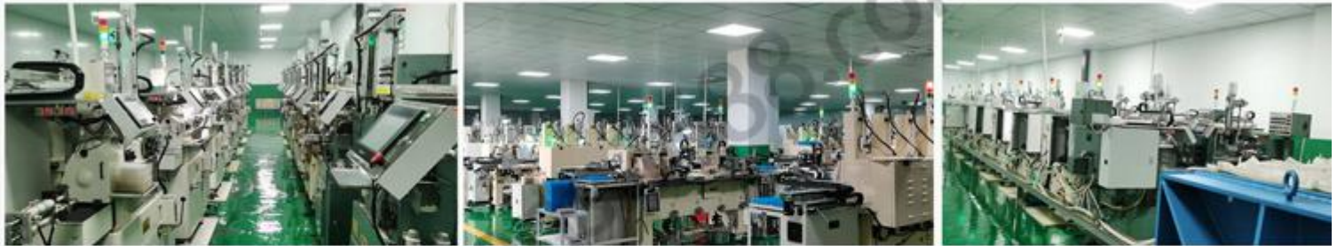
Glass lens processing equipment