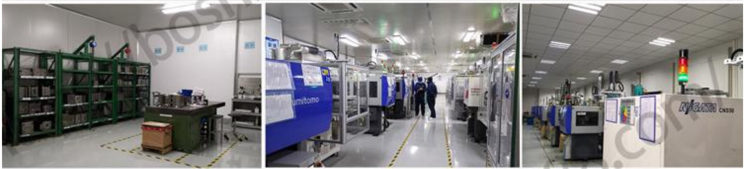
Plastic lens processing equipment