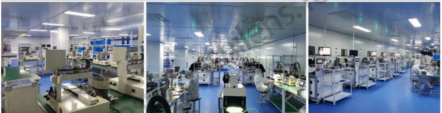
Assembly of testing equipment